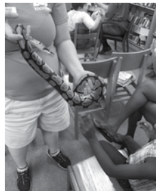
The Zoomobile brings hands-on experiences with exotic beasts to the library.