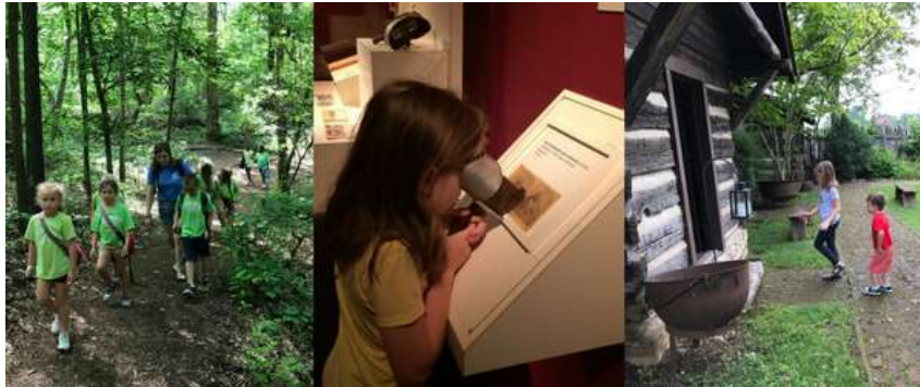
Stops on the Summer Library Club Passport Program include (left to right) Ijams Nature Center, McClung Museum of Natural History and Culture, and James White's Fort.

Summer reading in Knox County once meant regular trips to the bookmobile, the magical van that brought the library to neighborhoods once a week. One year, each book completed could be exchanged for a sticker for a map of the U.S. That map filled with stickers was a colorful testament to a summer filled with reading.