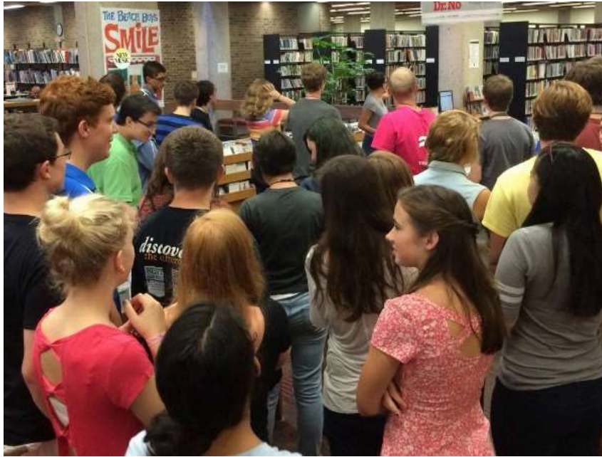
Students from the L&N STEM Academy tour Lawson McGhee Library

done-before arrangement, 38 juniors from the STEM Academy attended their co-taught AP English and history class in the meeting room at LML on Tuesday/Thursday mornings throughout the 2014–2015 school year. Their number increased to 43 as they continued this partnership in the 2015–2016 school year.