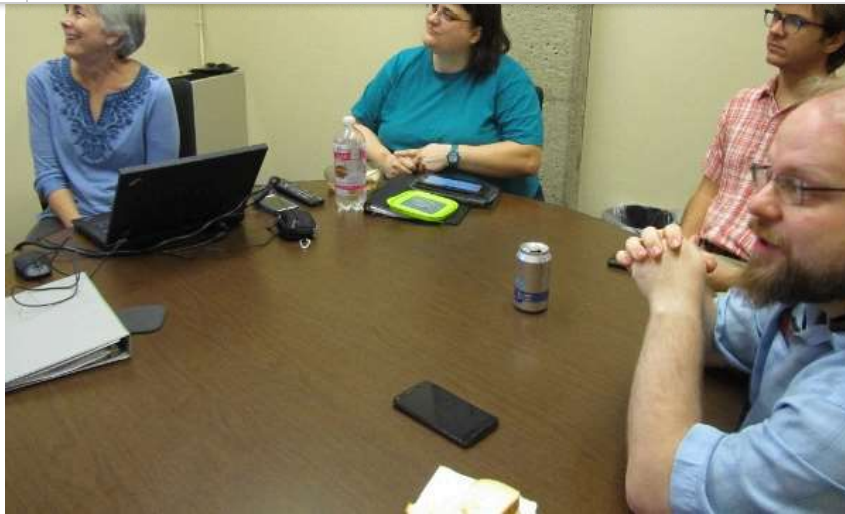
Lawson McGhee staff members watch a Spanish video during their lunch break