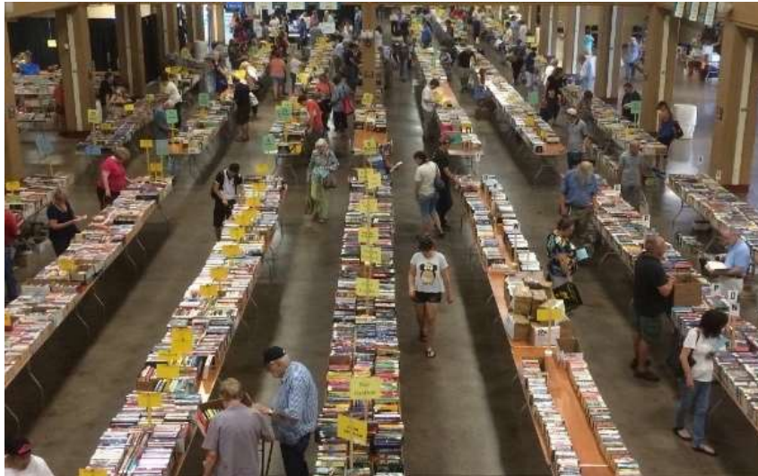
Shoppers at the Jacob Building on Saturday, June 25

After the 2016 Used Book sale wrap-up on Tuesday, June 28, Friends wants to express appreciation to many, beginning with the more than 150 volunteers who worked many hours over the past year and the six days of the sale to make the event a success.