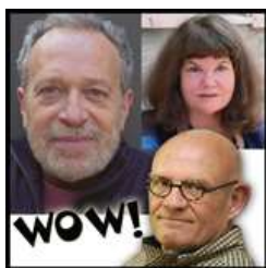
Coming Soon to Knoxville!

To find out more visit www.knoxlib.org or the American Library Association's special At Your Library web site.