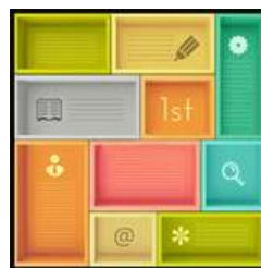
Hold On There! It's Easy.

Sunday, Oct. 19, East Tennessee Historical