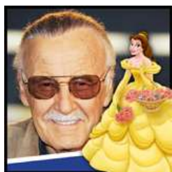
Sign Up in September!