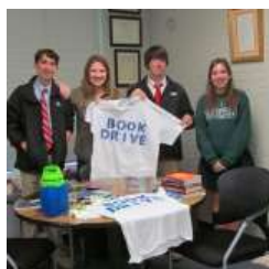
Members of the Webb School Literary Club promote the book drive for the Empty Stocking Fund this season.

Wednesday December 4 Noon Books Sandwiched In The Healing of America: A Global Quest for Better, Cheaper, and Fairer Health Care by T. R. Reid More>>