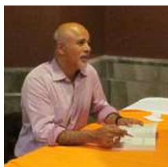
New York Times bestselling author Abraham Verghese signs his latest book for avid Knoxville fans at recent Friends-sponsored event.

Friends , in partnership with the Knox County Public Library and Union Avenue Books, is pleased to present An Evening with Elizabeth Gilbert at the historic Tennessee Theatre at 7 p.m. on November 2. Tickets are $35 (students/seniors $30) and includes a copy of Gilbert's latest book. Ticket Details