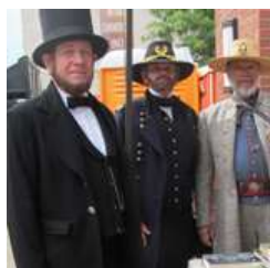
ABOVE: A trio of esteemed visitors stops by the Friends booth at the East Tennessee History Fair August 17, 2013

September is Library Card Sign-up Month . Here's a local tale that reminds all of us—parents, teachers, and readers—that a library card can be the most important school supply of all: