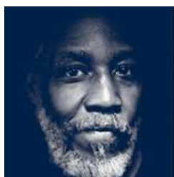
Sights & Sounds Mini Grants

Check out the Sights & Sounds blog today for the latest news about the library's media collection.