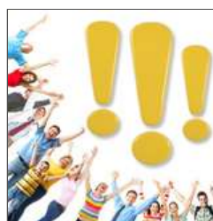
Don't Forget Your Friends

The event is co-sponsored by Friends of the Knox County Public Library, the East Tennessee Historical Society and the Knox County Public Library. Visit the library's website at www.knoxlib.org for more information.