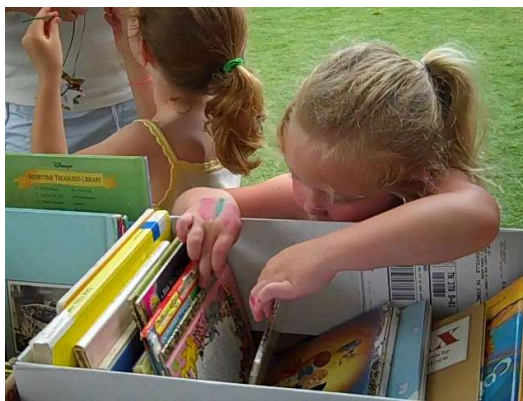
There's something for everyone and staff on hand to help you choose the perfect reads for YOUR favorite little ones!

Friends of KCPL is a major financial supporter of this FREE family event. We also work year-round sorting thousands of donated books, so that we can hold mini-sales at community events and at library branches. Dedicated Friends of KCPL volunteers make our used book sales possible, and they do it all to promote the love of books and reading in Knox County . COME AND SEE US!